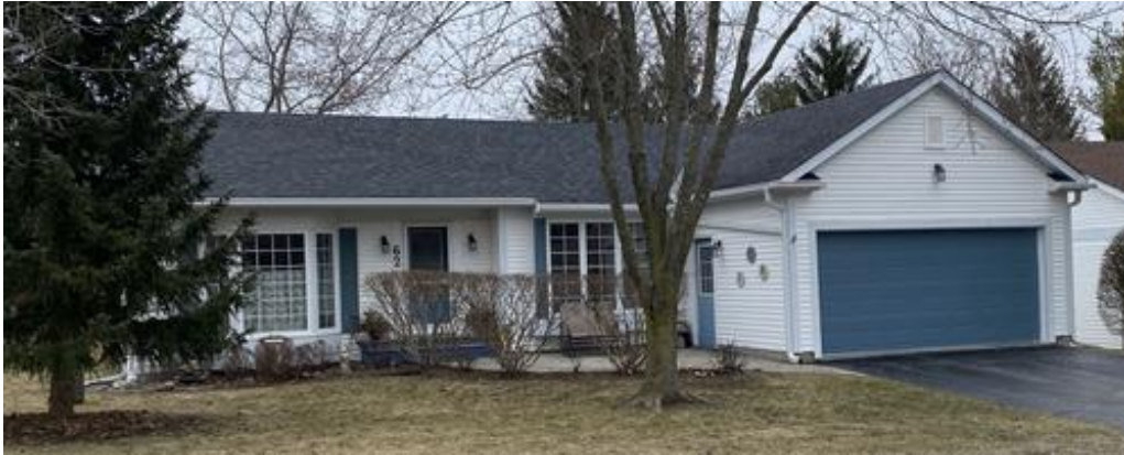
62 Meadow Lane