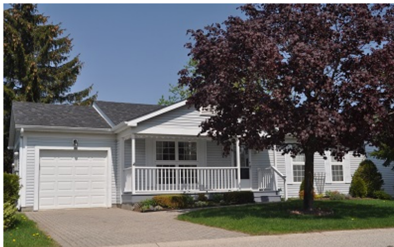
26 White Bark Way