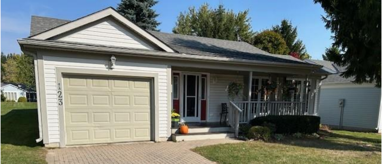
Montrose “B” with approx 1464 sq ft

123 Bristlecone Court – OPEN HOUSE – SATURDAY AND SUNDAY, OCTOBER 19 AND 20; 1:00 -3:00 PM